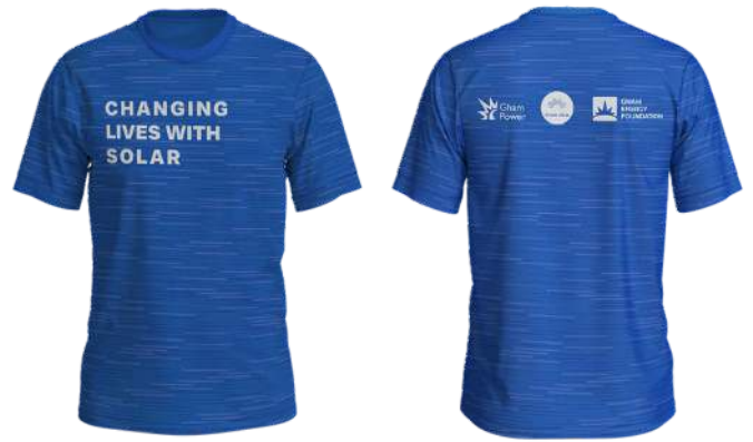
BLUE DNA SPORTY T-SHIRT