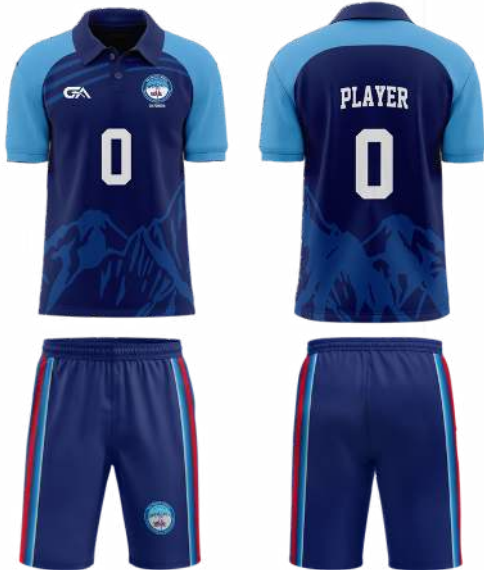
BLUE SOCCER JERSEY SET