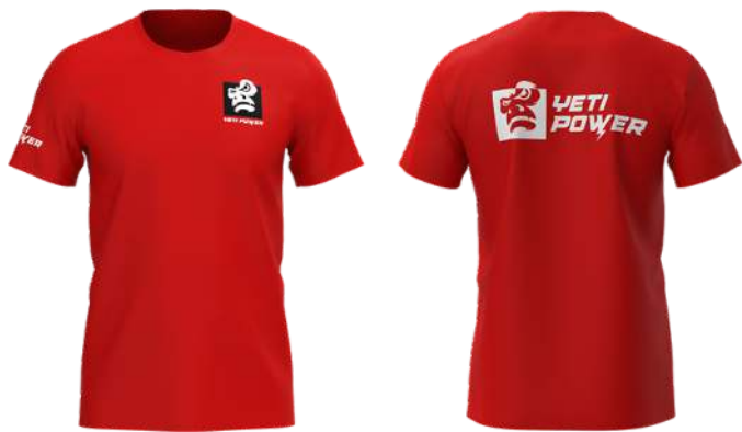
RED ESSENTIAL T-SHIRT