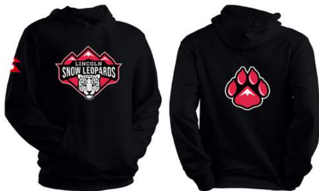
BLACK ESSENTIAL HOODIE