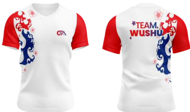
WUSHU TEAM SUBLIMATION