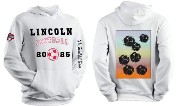
WHITE ESSENTIAL HOODIE