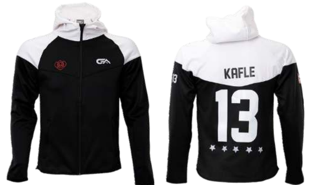
BLACK & WHITE TRACK JACKET