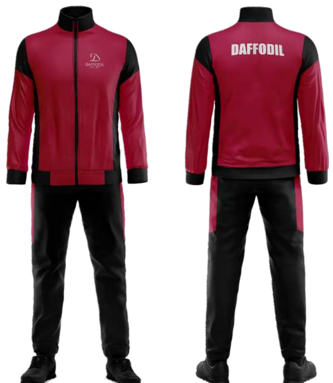
FULL ZIP TRACKSUIT SET