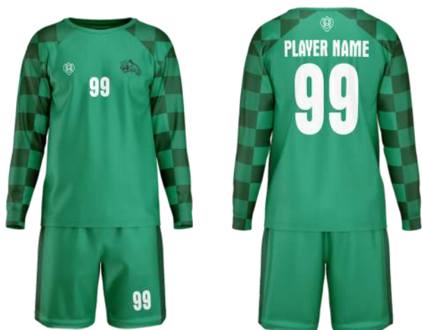
GREEN GOALKEEPER JERSEY SET