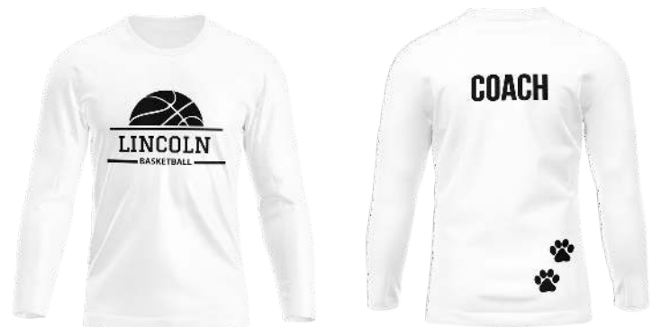
WHITE BASKETBALL COACH