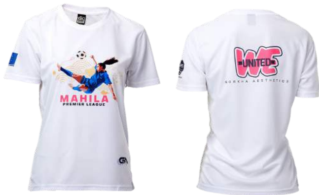
SOCCER TEAM T-SHIRT