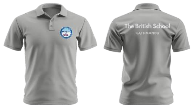
GREY POLO T-SHIRT