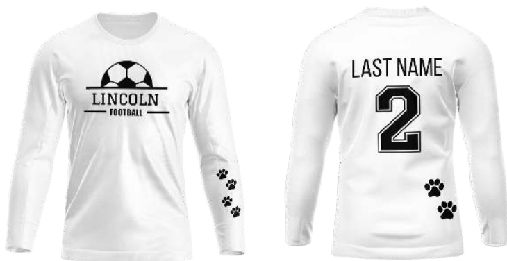
WHITE FOOTBALL FULL SLEEVE