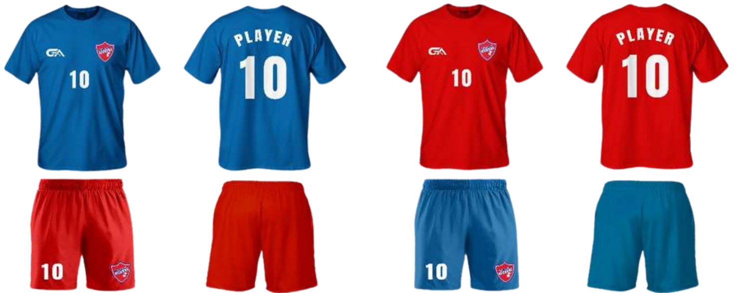
FOOTBALL TEAM JERSEY SET