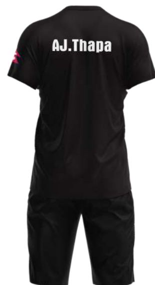
BLACK BADMINTON SET