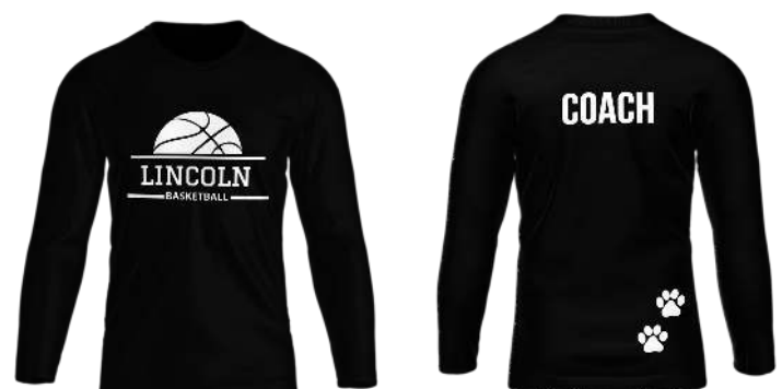
BLACK BASKETBALL COACH