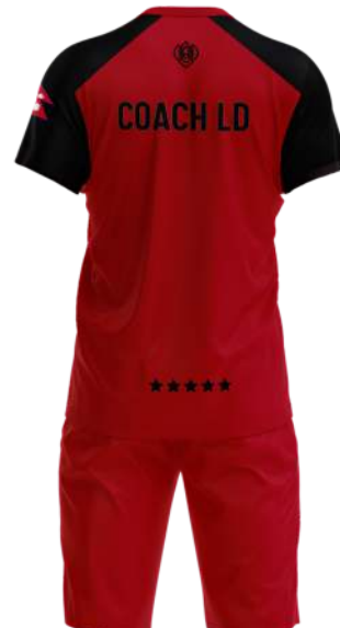
RED FOOTBALL COACH SET