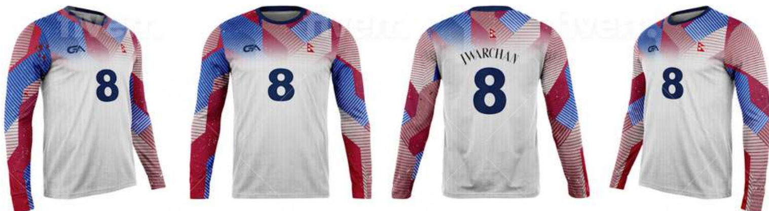
COLOUR PRINT SUBLIMATION JERSEY