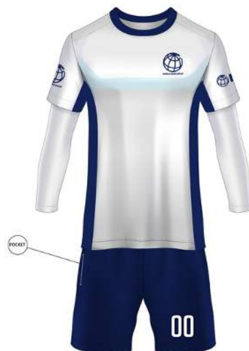
SUBLIMATION JERSEY SET