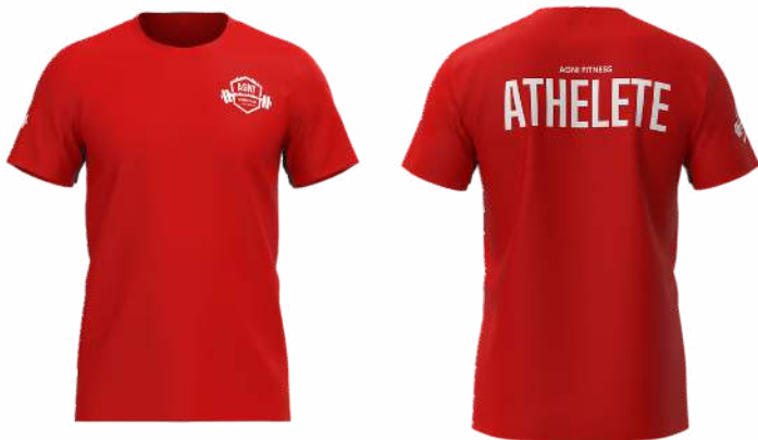
RED ATHLETE T-SHIRT