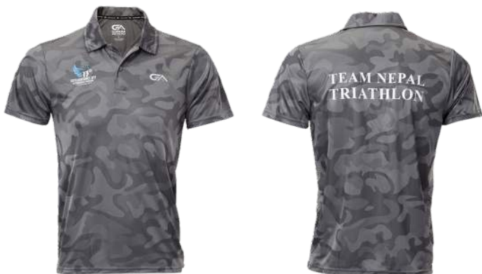
CAMO PRINT ON T-SHIRT