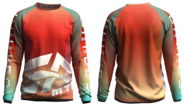
ORANGE SUBLIMATION JERSEY