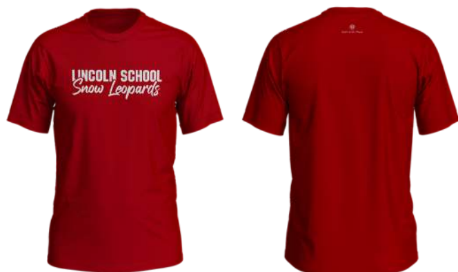
RED ROUND NECK T-SHIRT