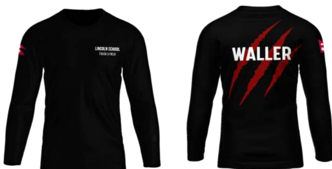
BLACK FULL SLEEVE T-SHIRT