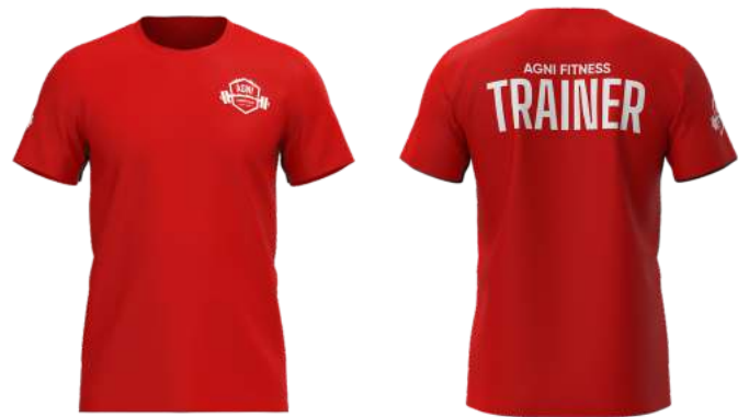
RED TRAINER T-SHIRT