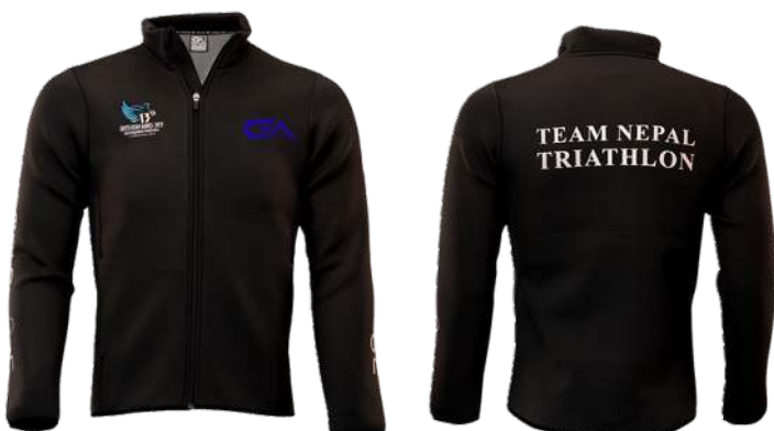
BLACK TRIATHLON TEAM TRACK