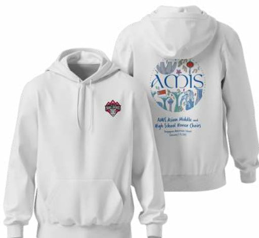
WHITE ESSENTIAL HOODIE