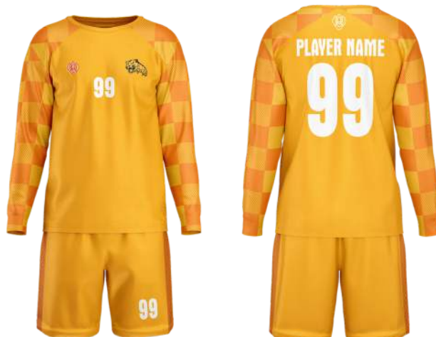
YELLOW GOALKEEPER JERSEY SET