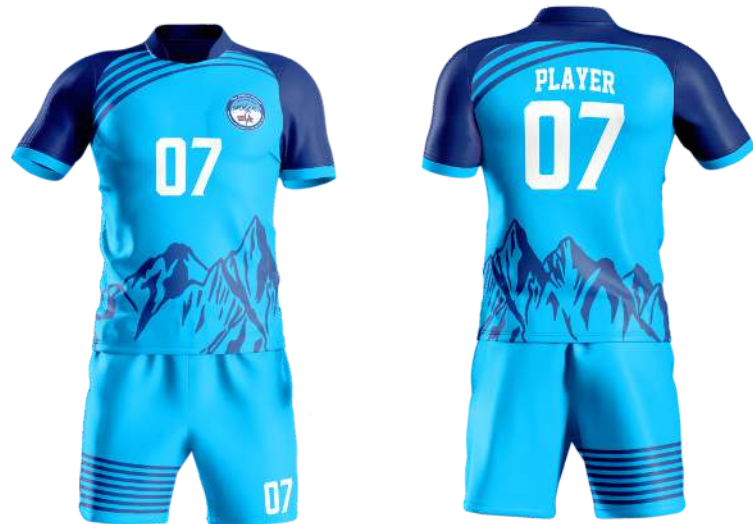
BLUE FOOTBALL JERSEY SET