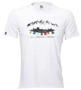
COLOUR PRINT ON T-SHIRT