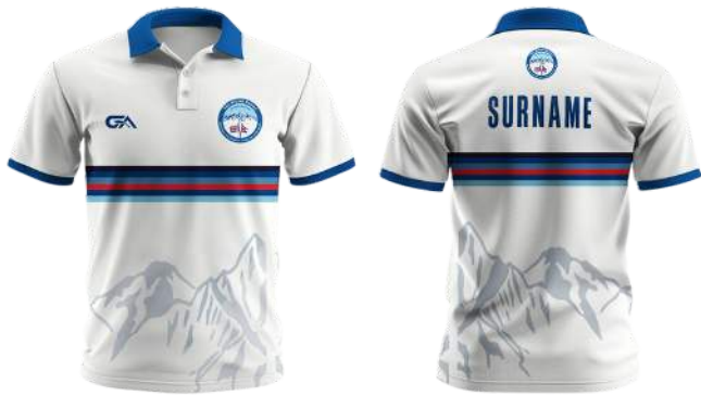
WHITE SUBLIMATION POLO SHIRT