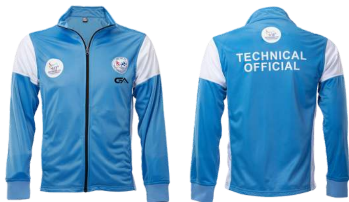
SWIMMING SUBLIMATION TRACK