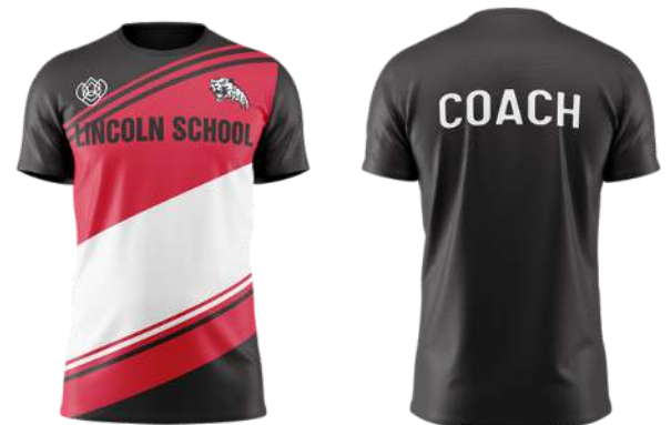
BADMINTON COACH HALF SLEEVE