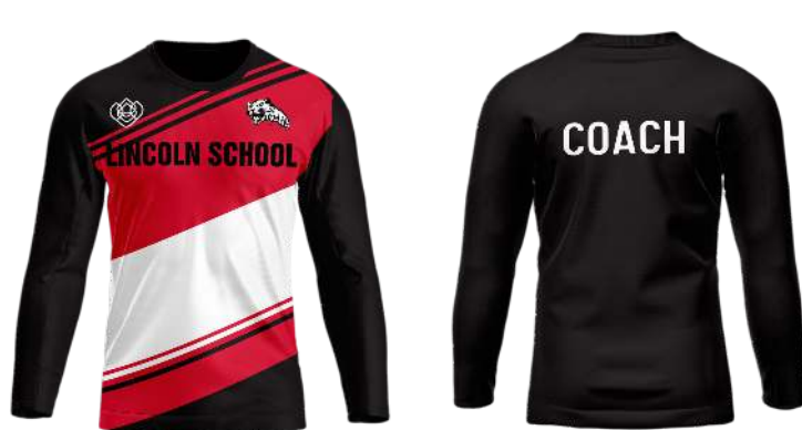
BADMINTON COACH FULL SLEEVE