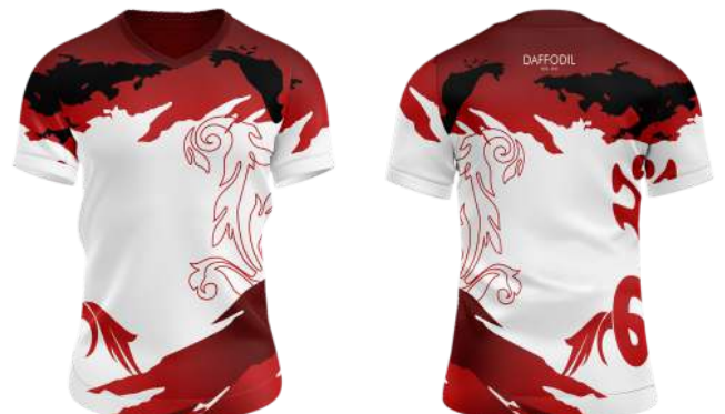
WUSHU TEAM SUBLIMATION