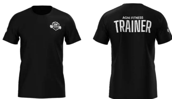
BLACK TRAINER T-SHIRT