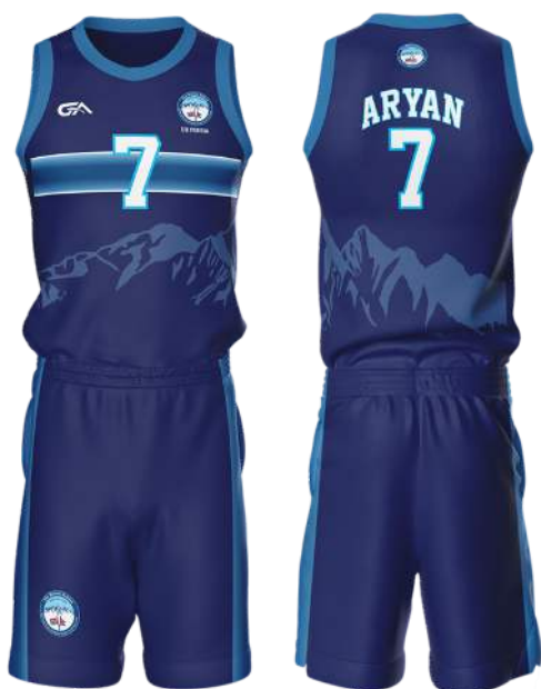
BLUE BASKETBALL KIT SET