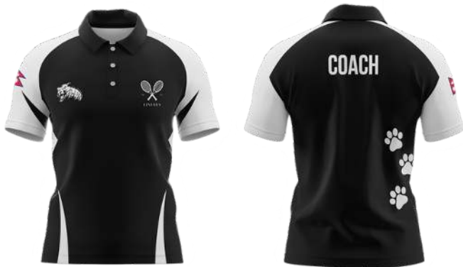
BLACK WANGLER COACH SHIRT