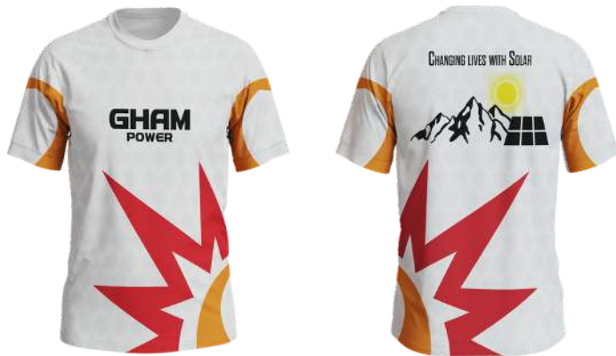
COLOUR PRINT SUBLIMATION