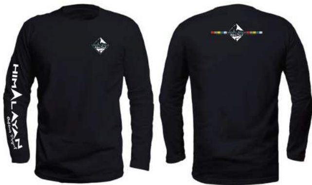
BLACK TRACK JACKET