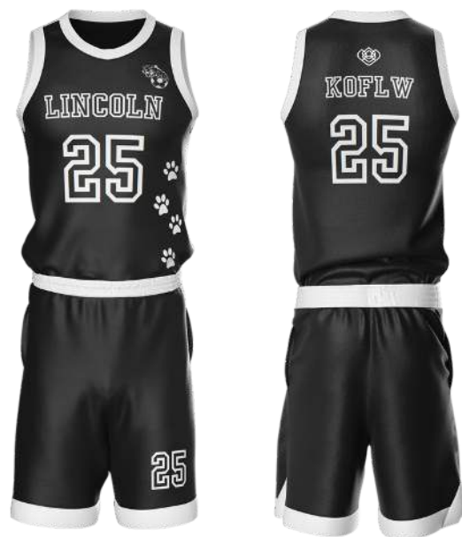
BLACK BASKETBALL KIT SET