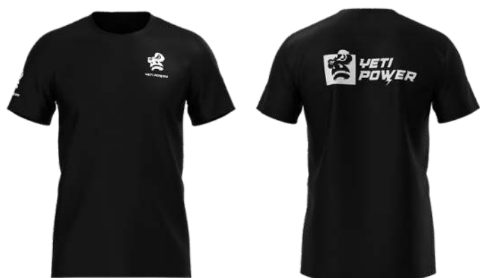
BLACK HALF SLEEVE T-SHIRT