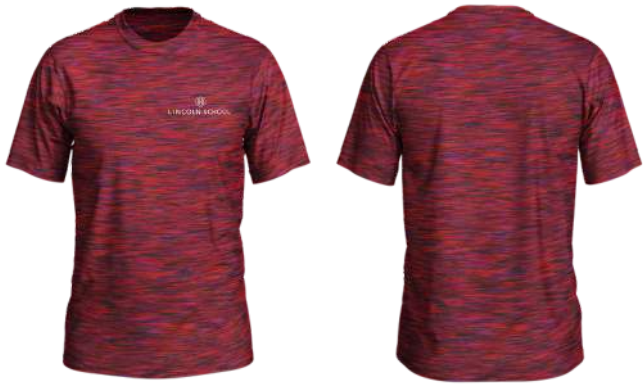
RED DNA SPORTY T-SHIRT