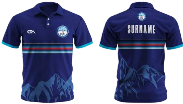
BLUE SUBLIMATION POLO SHIRT