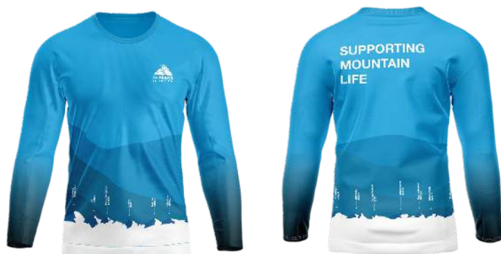
BLUE FULL SLEEVE JERSEY