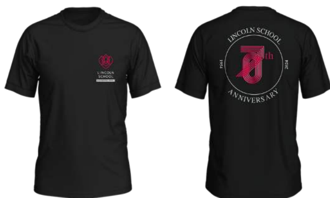
BLACK ROUND NECK T-SHIRT