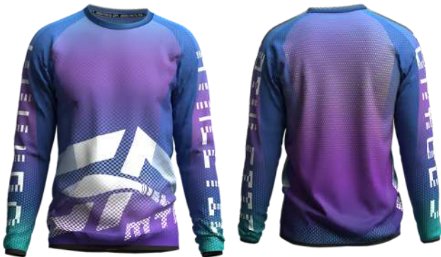
BLUE SUBLIMATION JERSEY