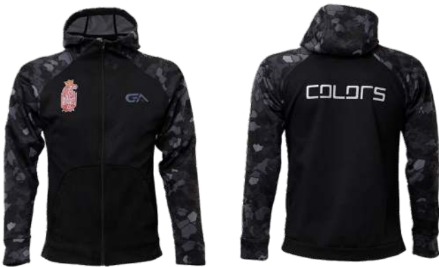
BLACK TRACK JACKET