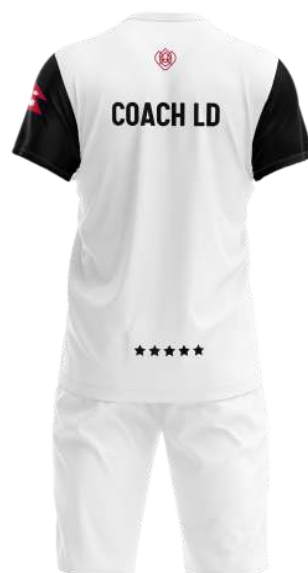
WHITE FOOTBALL COACH SET