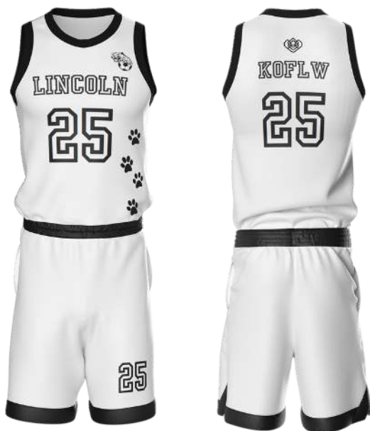
WHITE BASKETBALL KIT SET