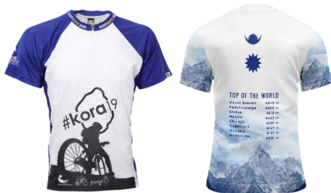
CYCLING TEAM JERSEY