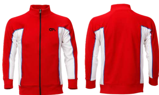
BOXING SUBLIMATION TRACK