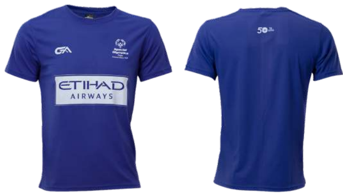
BLUE ESSENTIAL T-SHIRT