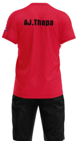
RED BADMINTON SET