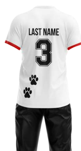
WHITE FOOTBALL SET