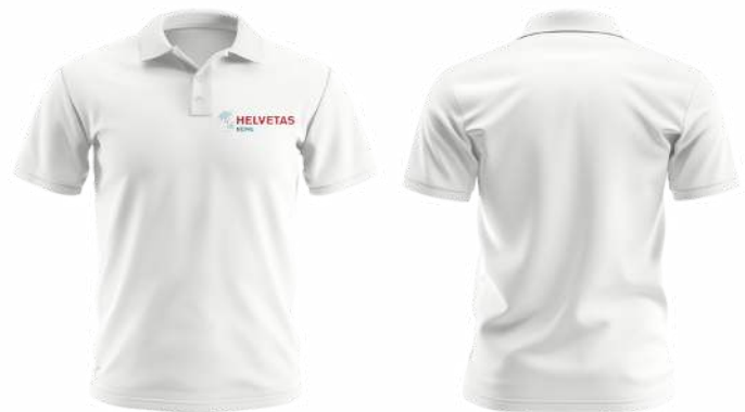
WHITE POLO SHIRT