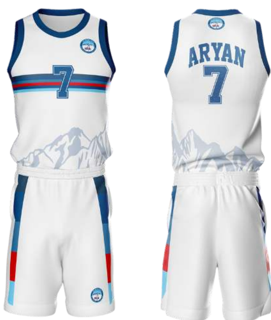
WHITE BASKETBALL KIT SET