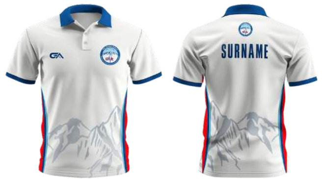
WHITE SUBLIMATION POLO SHIRT