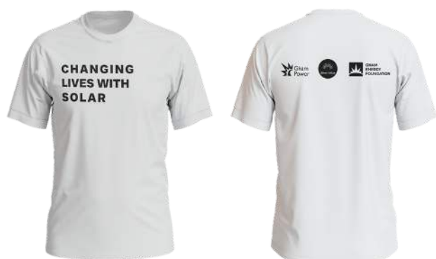
BLACK PRINT ON T-SHIRT