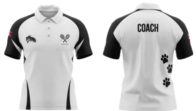
WHITE WANGLER COACH SHIRT