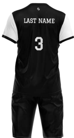
BLACK FOOTBALL SET