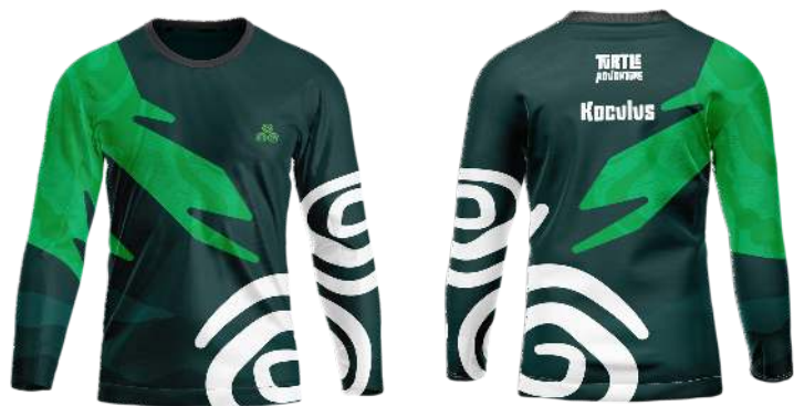
GREEN FULL SLEEVE JERSEY