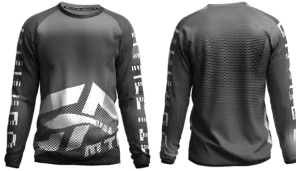
BLACK SUBLIMATION MTB JERSEY