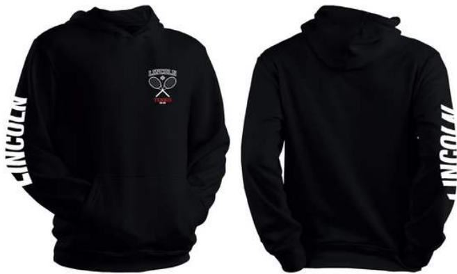
BLACK ESSENTIAL HOODIE