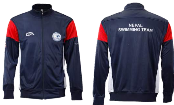
SWIMMING TEAM TRACK