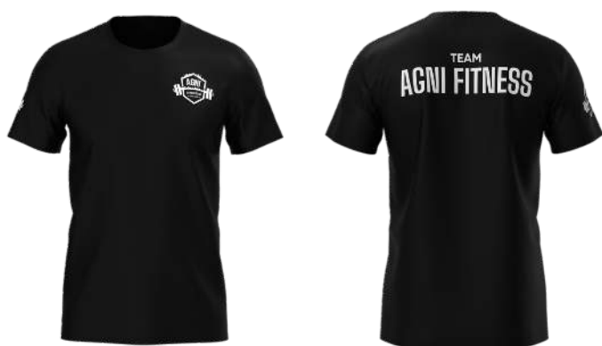
BLACK FITNESS T-SHIRT