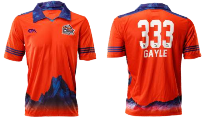
RED SUBLIMATION JERSEY