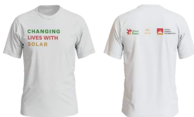
COLOUR PRINT ON T-SHIRT